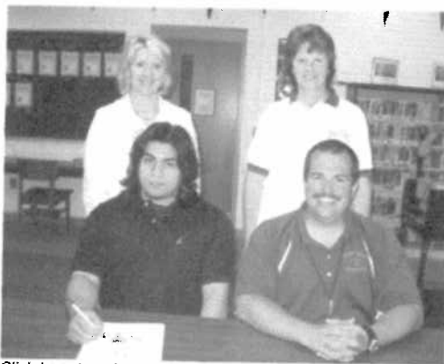
Click here to enlarge this photo